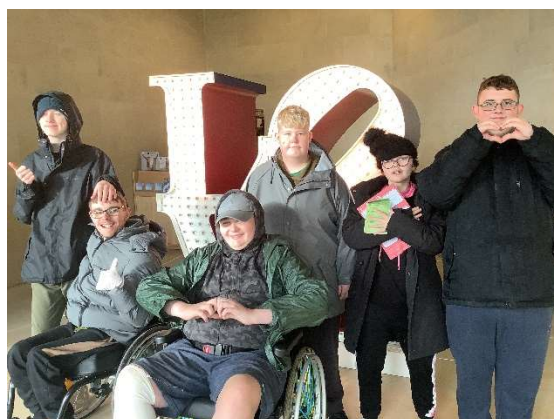
Oak 'LOVE' Yorkshire Sculpture Park

Oak class have been working towards their Arts Award Explore a, d we went on a trip to Yorkshire Sculpture Park, which we all loved.