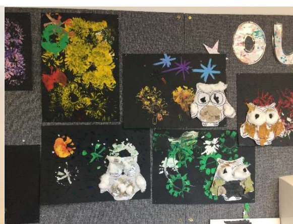
Owls and Fireworks